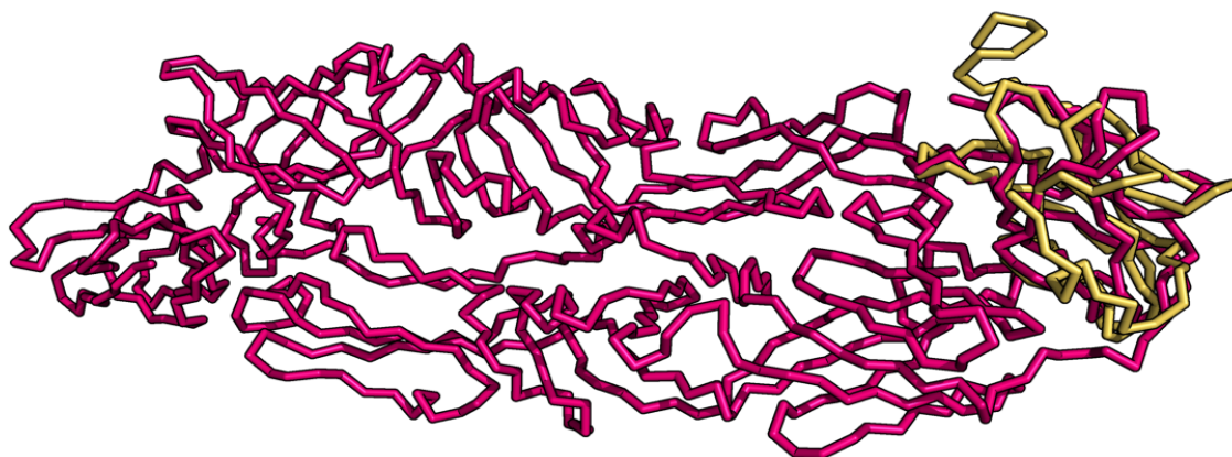
Figure 3: 1OKE vs. 1S6N. Aligned 96 residues to an RMSD of 2.260Å.