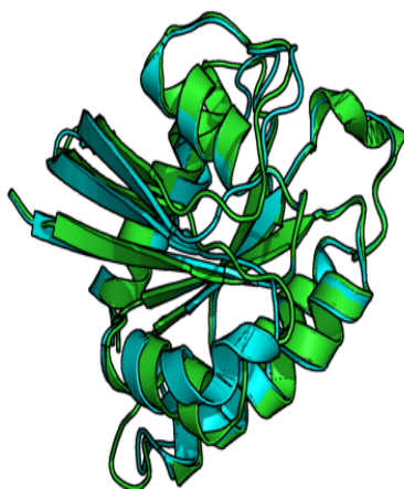
Figure 2: 1CTQ to 1KAO